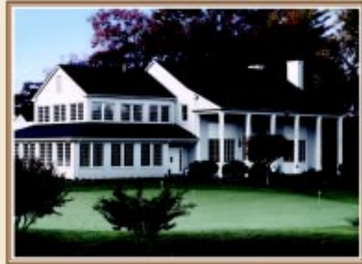
MIMOSA HILLS GOLF AND COUNTRY CLUB